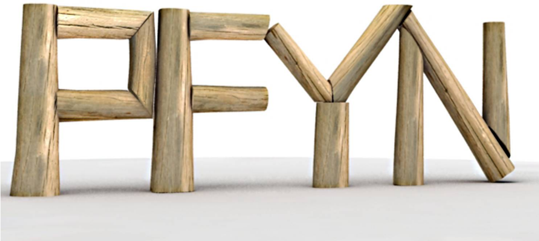
Rendering of the sculpture.