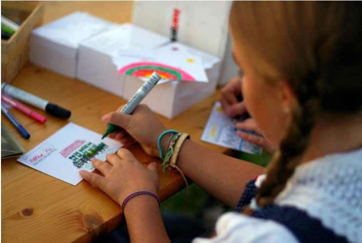
Filling up the postcard on August 1 st , 2011