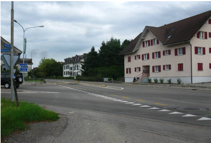
The intersection where the roundabout will be placed